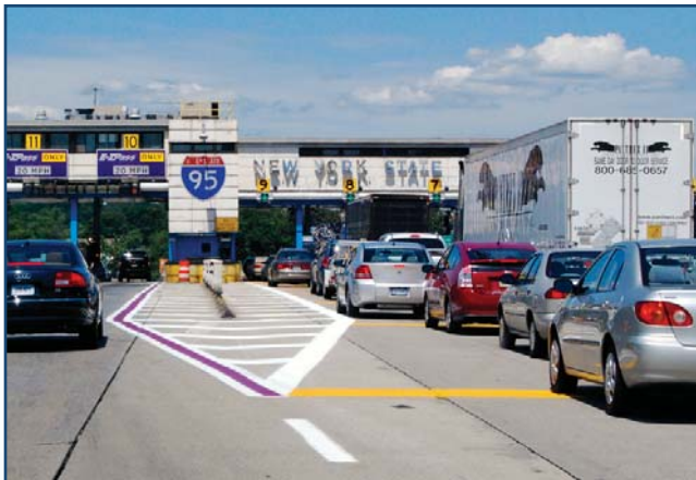
Traffic congestion resulting from manual cash collection

RTL solutions can be customized to meet each customer's unique business needs. In addition, each solution is flexible and works with video or transponder technologies.