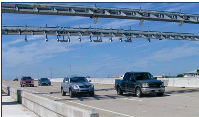
Electronic toll collection equipment at a toll gantry

When a cash option is not available and a car is not equipped with the appropriate toll transponder, the applicable toll authority uses video technology to obtain the vehicle license plate number. A bill for toll fees and/or fines for failure to pay the toll is sent to the registered vehicle owner. In the case of vehicle leasing companies, they receive the fines and must either pay the invoice and send it to the fleet manager, or send it directly to the fleet manager to pay. The longer it takes for the fee to be paid, the higher the fines. Violation charges and late fees can turn a single missed toll fee into thousands of dollars in fees, fines, overhead costs, and legal fees. When fines and fees are multiplied over several vehicles and several toll authorities, the impact to a company's overhead becomes substantial.