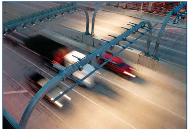
Traffic flowing through an ORT gantry

A better solution is to implement an innovative technology that will improve overhead and expense management. Rent A Toll® (RTL) offers the only patented system that eliminates toll violation exposure, fines, and the work hours spent on processing and fines by leasing agencies and fleet managers. Its toll fee tracking system utilizes video or transponder technology, depending on the area in which the vehicle operates, and integrates the electronic data exchange between leasing agencies and the respective toll authorities to provide accurate toll charges for fleets. RTL's system is accepted by multiple toll authorities throughout the United States. Use of the RTL system frees employees from tracking toll fees and using manual toll lanes.